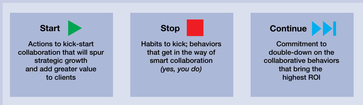
Figure 3: Three different types of developmental actions