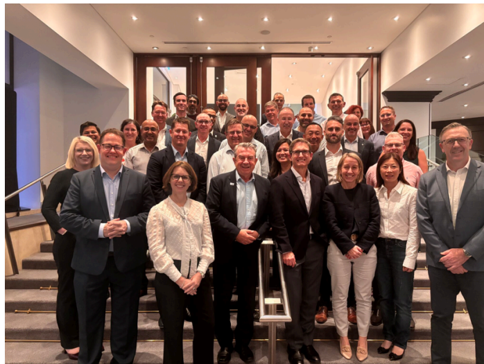
Photo from one senior leadership meeting

We will be back in Sydney the week of September 15. Let us know if you're interested in hosting an event - whether a keynote, client workshop, senior leader strategy session, or SC tool certification (by emailing ideas@gardnerandco.co ). Check out the next section for some sessions that are already in the works.